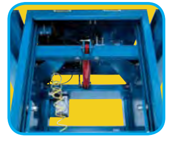
BE-SS Undercarriage detail