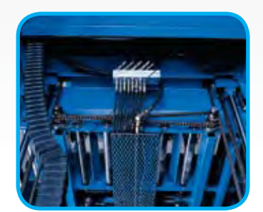
BE-TS Undercarriage PlumbingDetail