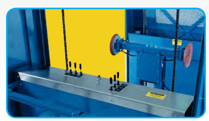
BE-DS Control Console