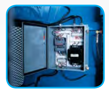
BE-TS Control Panel