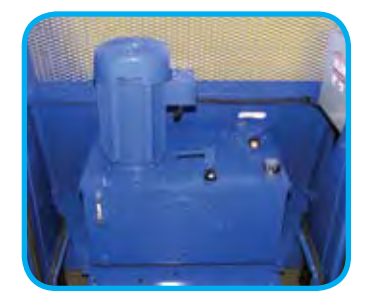
BE-QS Operator Compartment