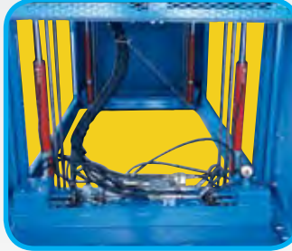
BE-DS Hydraulic Component Detail