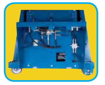
BE-SS Hydraulic Component Detail

Engineered for safety, the BHS Single Side System features a heavy-duty structure with various available options to meet your specific needs. The extractor is fully hydraulic, track mounted, and floor driven for added convenience.