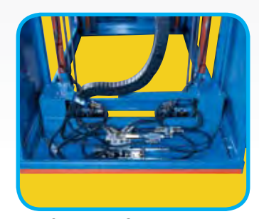
BE-TS Hydraulic Component Detail